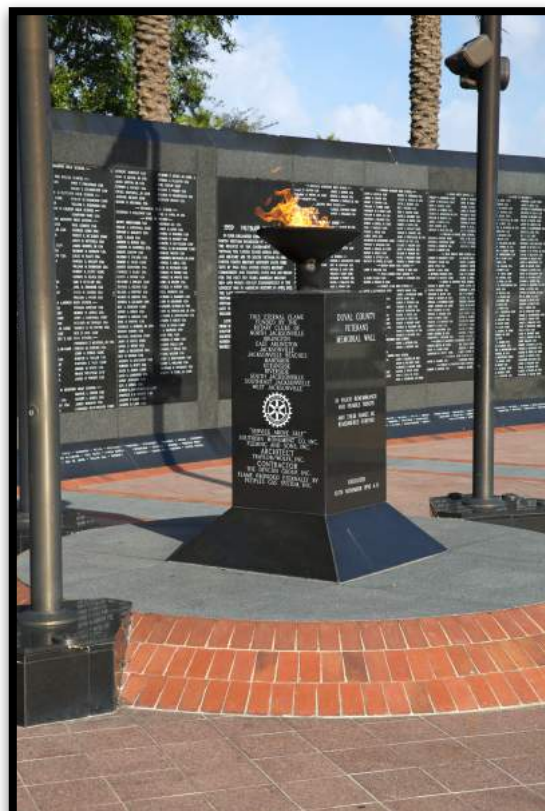
Jacksonville Veteran's Wall