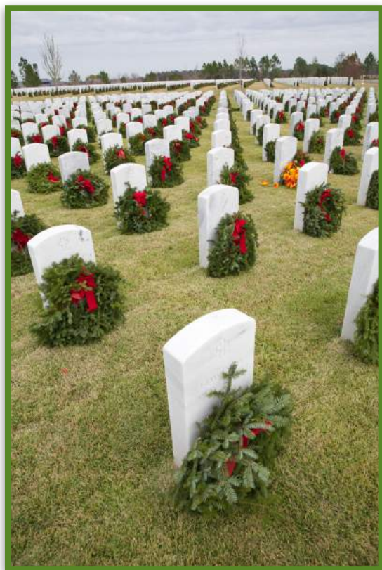
Jacksonville Memorial Cemetery