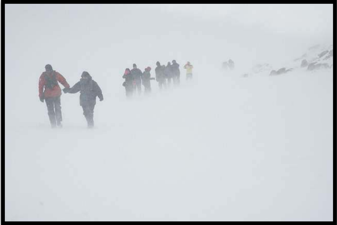
“Katabatic Wind” by Don Dymmer First Place in F3C Annual Documentary