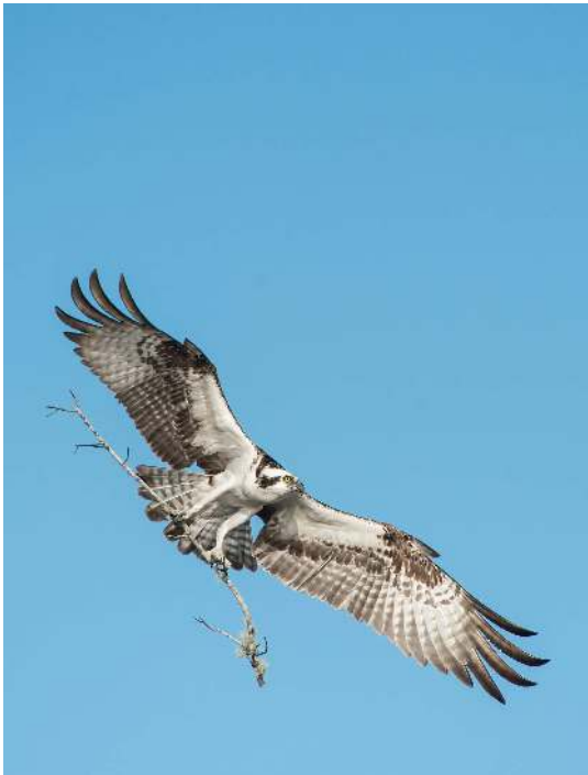
Osprey