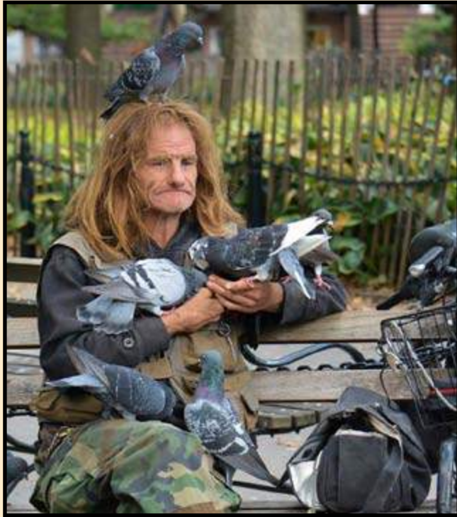
2nd The Comfort of Good Friends by Duffy McCoy