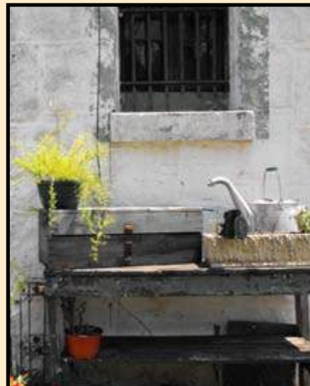
2nd Pickens County Jail