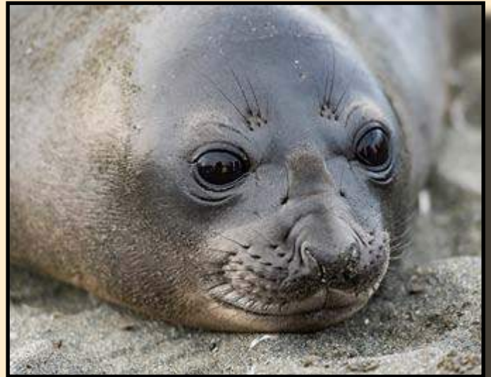
2nd Elephant Seal by Bronwyn Horvath