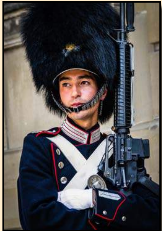
3rd Danish Royal Guard