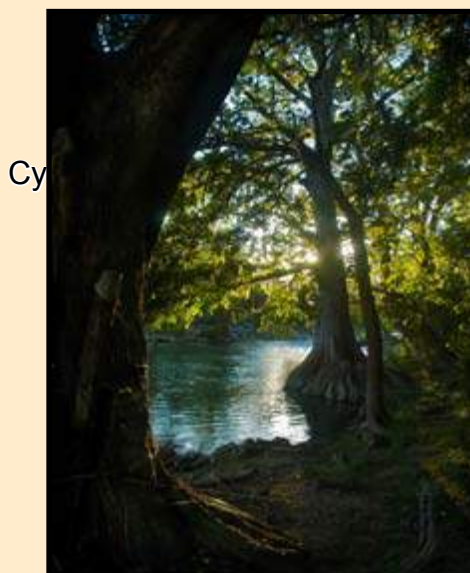
Hon Texas Serenity by Chuck Shealy