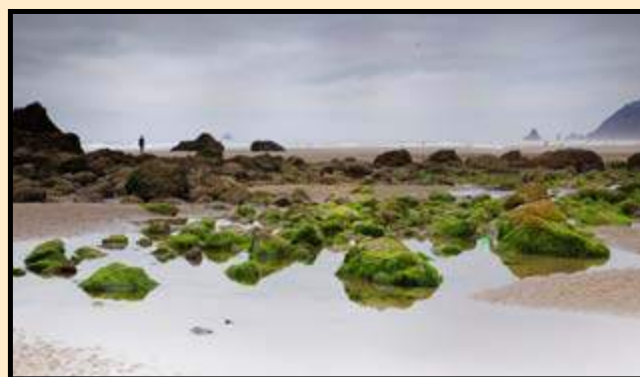
Hon Canon Beach by Fred Raiford