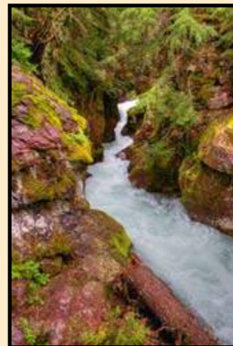
Hon The Thaw by Fred Raiford