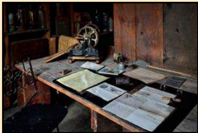
Hon Apothecary's Desk by Craig Shier