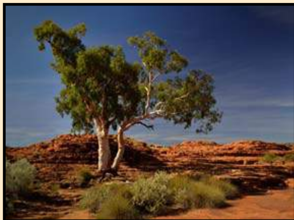
Hon Gum Tree by Craig Shier