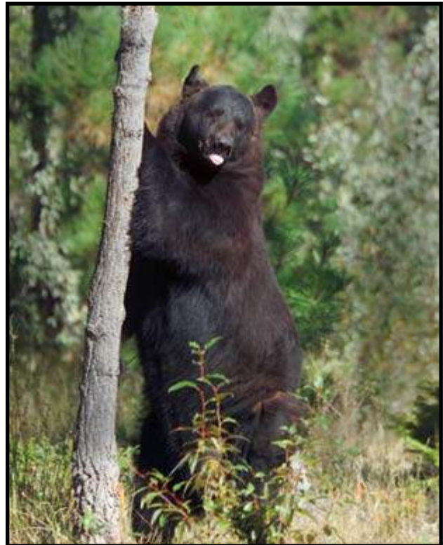
Bears

Colony off the coast of Maine and explained how to shoot pictures from a hunting blind.