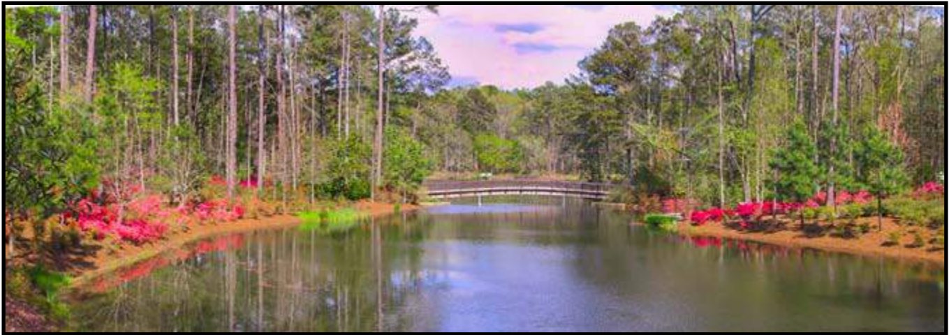
Panorama taken on JCC trip in 2013