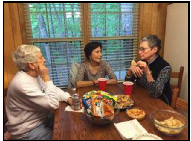
on the JCC Facebook page