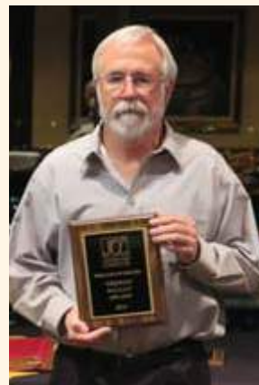
Vernan Nalley Award