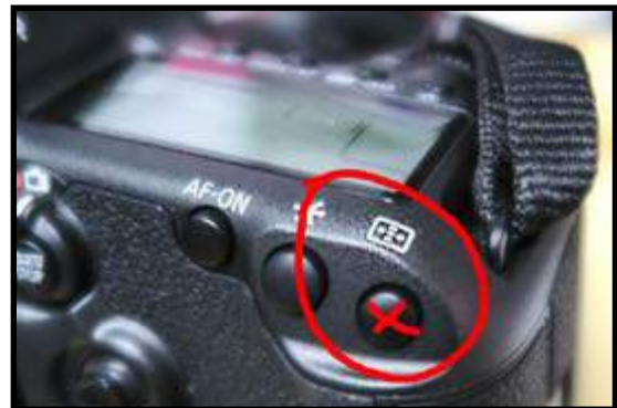
This is the AF selection button on my Canon

The AF selection button puts this picture in your viewfinder or Live View and you can move it around using the toggle button (on my camera), to place it on the item that you want to be in focus.