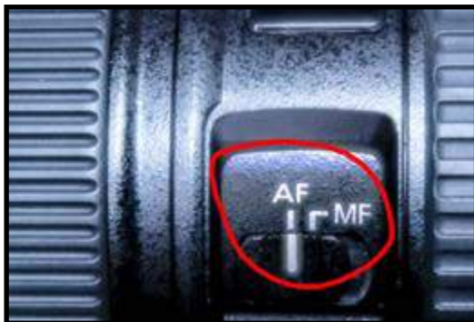
To use the auto focus, leave the lens on AF