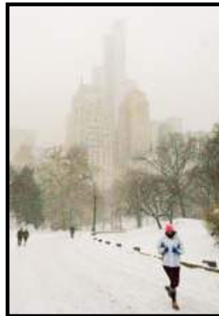
NYC Jogger 2

But, of course, we weren’t ready. It was far colder than Antarctica. (Yes, really!) The snow fell furiously...but not straight down. It gusted and blew horizontally, knocking small dogs off their feet, while I trudged through 3 foot drifts at a 45 degree angle.