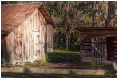
These are some pictures that were taken by several different members.