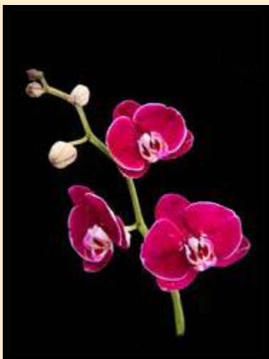
Red Orchid taken with the focus stacking method described on page 6 by Gordon Ira