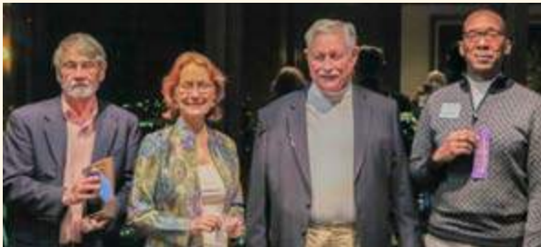
Print Winners, General