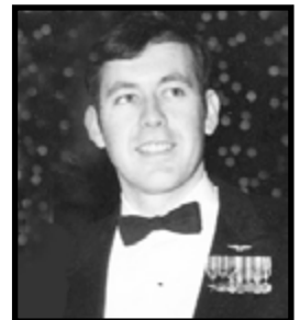
Young and Handsome Naval Pilot

brief screen show (with music) of a few of just my glamour shots to lead into the final segment. Finally, another power point presentation where I will review working with models, lighting setups for portrait photography, and other hints and tips.