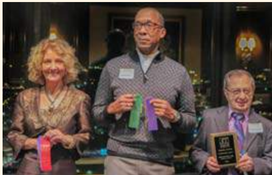
Print Winners, People