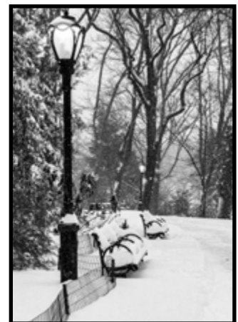
Central Park in the Snow