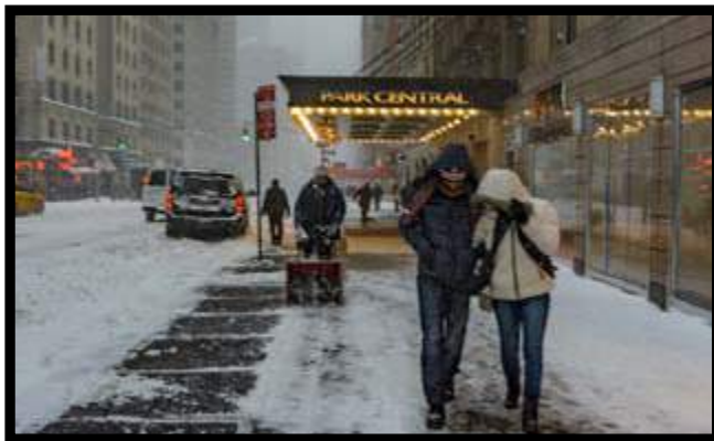
Waling in the snow

But, of course, we weren’t ready. It was far colder than Antarctica. (Yes, really!) The snow fell furiously...but not straight down. It gusted and blew horizontally, knocking small dogs off their feet, while I trudged through 3 foot drifts at a 45 degree angle.