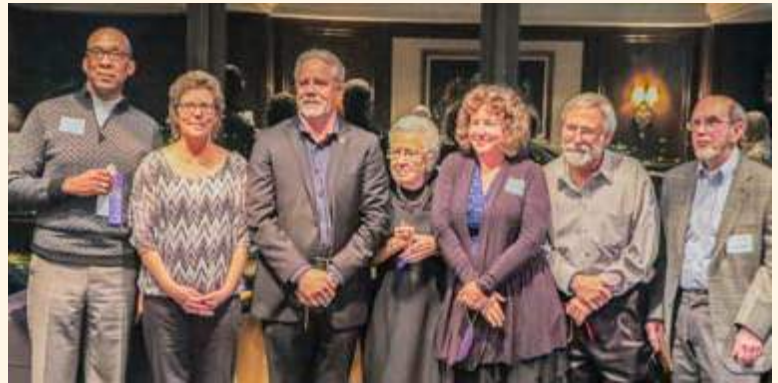
Print Winners, Nature